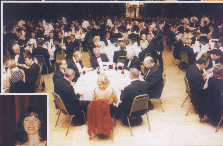
CU Peat Prizewinners